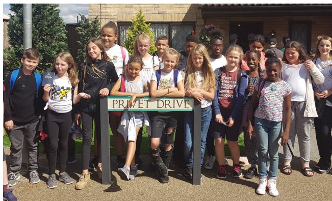
Lining up for the Harry Potter trip