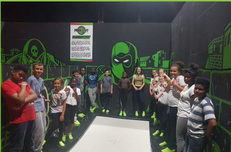
Club members at the 'Flip Out' trampoline arena

To get involved, contact Amy Rushton on 0121 525 5969 .