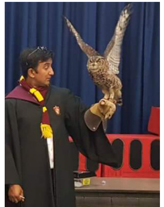
An owl visit