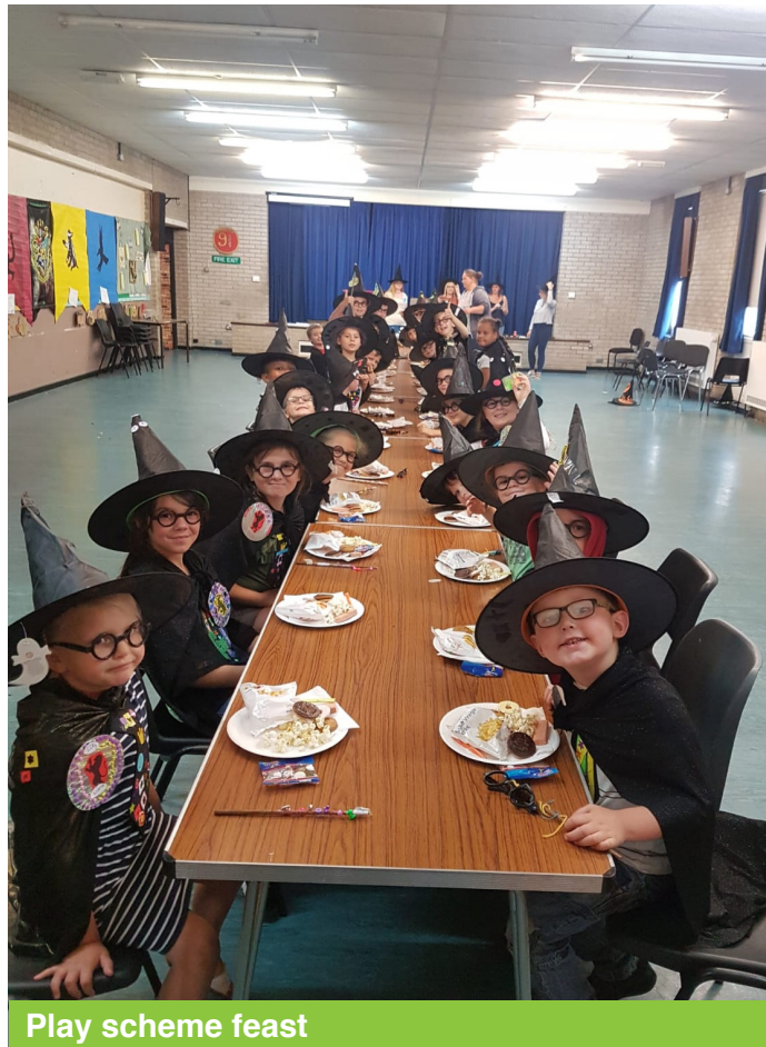
Play scheme feast

included decorating wands, creating charms and potions, a Quidditch match and a feast for would-be wizards and witches.