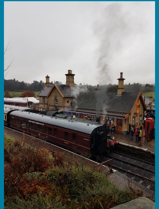
The Santa Steam Special