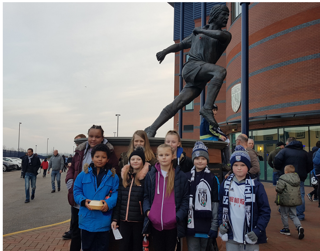
Lyng youngsters at the Baggies' ground

The trip was made possible thanks to the Baggies' official sponsor, Ideal Boilers, gifting tickets to the LCA Youth Club.