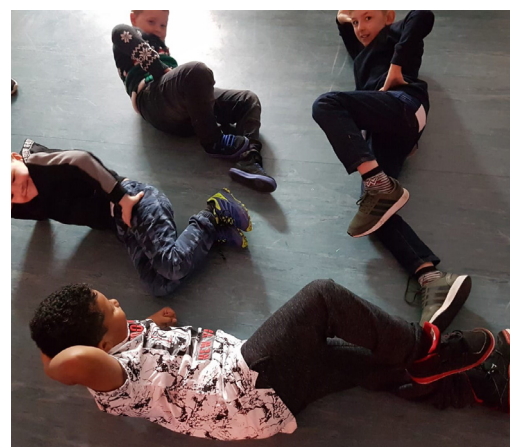
Getting into the festive spirit

Held at the Church of the Good Shepherd with St John, there were party games, plenty of food, a disco and the chance to meet Father Christmas in his grotto.