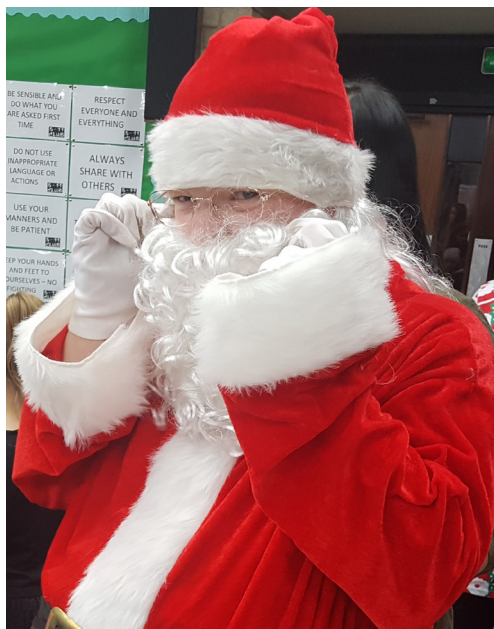
Santa drops in

Youngsters also showed off their artistic talents in our ever-popular Christmas card making competition.